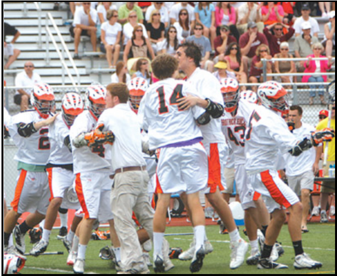
The Birmingham Brother Rice lacrosse team storms the field after winning the Division 1 state championship June 6 at Troy Athens. The Warriors beat University of Detroit Jesuit 12-11 in the final.